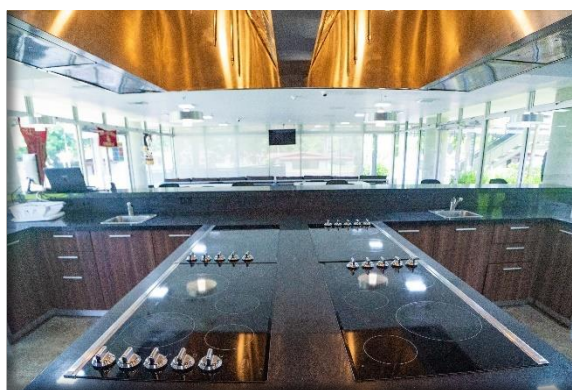
FSU Panama Kitchen

To have repairs done in student rooms or common areas, report them to the Program Assistant who will forward it to the City of Knowledge front desk for action. Request for Information Technology services or Pest Control needs (i.e. fumigation) are handled similarly through the Program Assistants assigned to the dorm. Program Assistants in conjunction with the City of Knowledge arrange for scheduled maintenance (i.e. safety and health) inspections, air conditioner maintenance, and other special cleaning and repairs. Students are notified at least 24 hours before. Every semester, students are provided prior with the schedule for the weekly cleaning day and time.